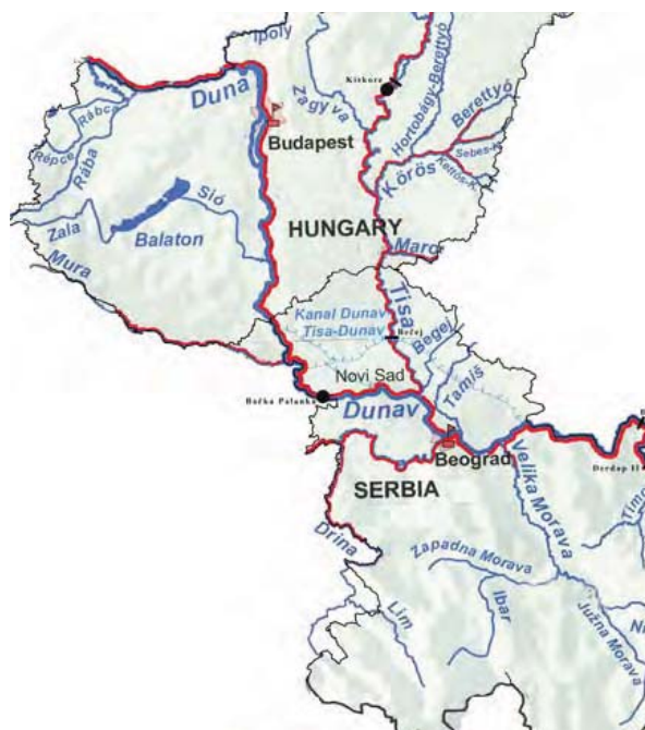
Figure 1. Distribution of sterlet ( Acipenser ruthenus L.) in Serbia and Hungary

Distribution of sterlet in Serbia and Hungary is represented on Figure 1. There is one dam on Danube in Hungary (Gapčikovo – 1822 rkm), two dams in Serbia on Danube (Đerdap I - 943 rkm, constructed 1970, Đerdap II – 863 rkm, constructed 1984), one dam in Serbia on Tisza (Novi Bečej – rkm 63) and two dams on Tisza in Hungary (Tisaleka – rkm 518, finished 1957, Kiškerea – rkm 404, finished 1973). There are no fish passes on these dams, so only accidental pass of sterlet is possible across dams. In that way isolated populations of sterlet were formed on different side of dams with small possibility for their mixing.