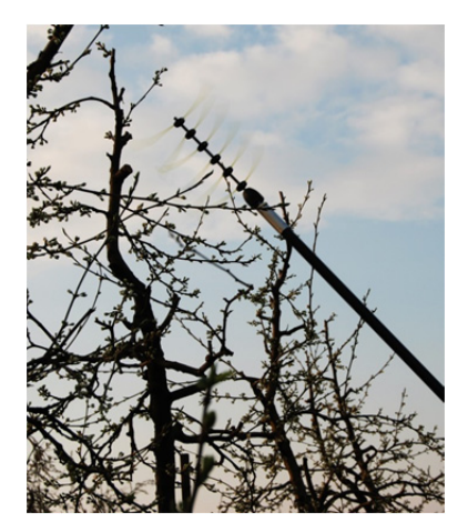
Figure 5. The Electroflor hand-held mechanical thinning device developed in France.