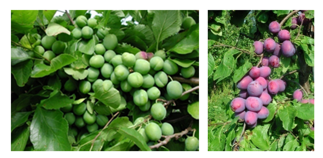
Figure 1. Oversetting of 'Opal' plums (left) and 'Jubileum '(right). (Photo's: Mekjell Meland).

There are three principal methods of regulating the crop loads of plum. Numbers of flowers on the tree can be reduced; flowers can be prevented from fruit setting and the amount of fruitlets reduced by thinning methods (Dennis, 2000). One or more of these methods can be combined.