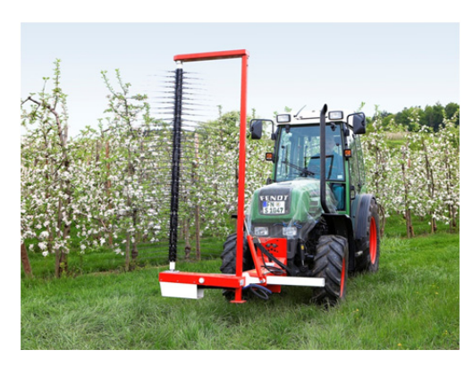
Figure 4. The Baum machine (left) and the Darwin machine (right) both originating from Germany.