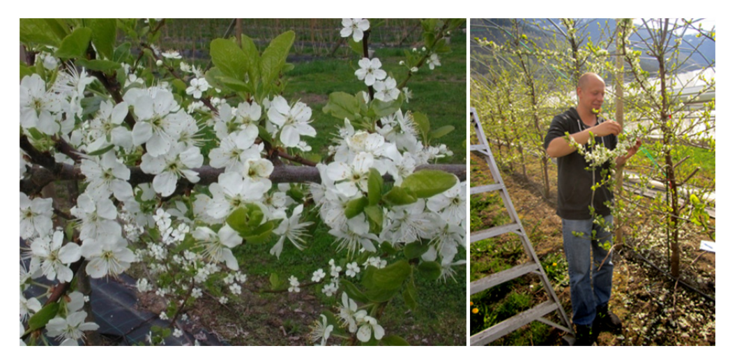
Figure 3. The plums trees have abundant of flowers (left). Handthinning is labouring intensive (right). (Photo's: Mekjell Meland).

The fruit size at harvest can be improved by reducing the competition between fruits for water and assimilates in the early stage of fruitlet development. Early reduction in the season by flower thinning, improves the amount of floral primordia the next year (Goffinet et al., 1995; Hansen, 1971; Meland, 1998). This is particular important for cultivars with abundant fruit set and for cultivars situated in areas with favourable conditions for fruit set. However, growers consider flower thinning as a high risk and like to be sure to have adequate fruit set before conducting any reduction of the crop load. Flower thinning can be conducted by hand, mechanically and by chemical methods.