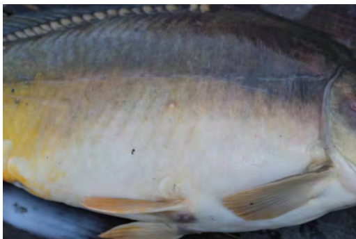
Figure 2. Four year old spawn carp with cyst located on skin

not observed in one-year-old fry. The cysts were mainly present in carps, which were completely covered with scales, but also in mirror carps, where plasmodia were located in the dorsal row of scales. Also sporadic, cysts were detected on the skin of four-year-old spawn carp (Fig. 2)