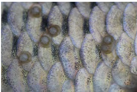
Figure 1. Cysts present on scales of two year old common carp fingerling

During the five-year investigation, round cysts reaching 3 mm in diameter (Fig. 1) were found on scales of 2 to 4 year-old pond-cultured common carp. The cysts were located at the outer margin of scales. The cysts sizes were related to different stages of infection. They were significantly smaller at the beginning of infection than in the final stage, when reaching a maximum size. Plasmodia on scales were present from the beginning of April until the end of May, while characteristic changes were not observed during the rest of the year. In 2008, the cysts were observed on scales in Susek, Žabalj, Jazovo and Bač fish farms, while in the period of 2009-2012 scale changes were present in all investigated farms. The prevalence of infection ranged from 2 to 75%, while its intensity was 2 - 206 cysts per fish.