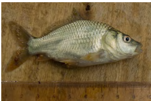
Figure 3. Cyst present on the common carp fins.

Thelohanellosis on the fins was also present in all investigated fish farms. Cysts were noticed in the 60 days old carp fingerlings. The prevalence of infection ranged from 3 to 30 %, while its intensity was 2 -84 cysts per individual. Cysts were present in all fins (Fig. 3).