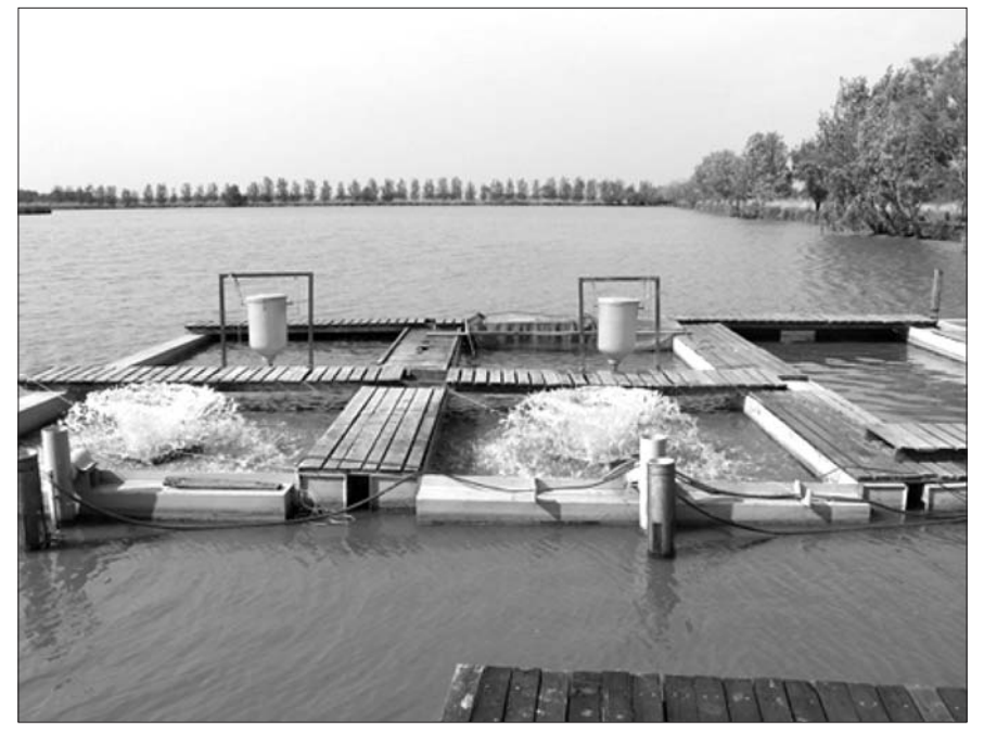
Figure 1. The intensive unit of the "Pond-in-pond" system in operation in a 20 ha extensive fish pond of the "Jaszkiseri "Halas" Kft"

total volume of 120 m<sup>3</sup>. The intensive unit was placed in one corner of a 20 ha extensive fish pond where conventional polyculture production was carried out (Figure 1.).