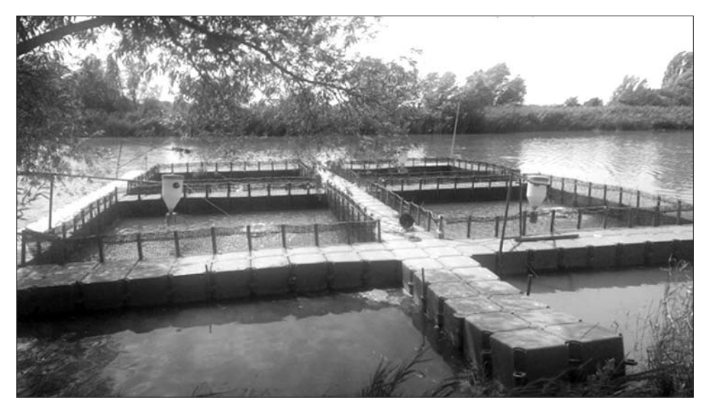
Figure 2 . Floating cages in a fish pond at the "Aranyponty Zrt." for the intensive rearing of European catfish

pond (Figure 2). Floating pellet was distributed to the cages by automatic feeder driven by solar panels. The fish meal was substituted completely by soybean meal and meat meal. The F.C.R. was 1.95 kg. When the dissolved oxygen level in the pond decreased to low level paddle wheel aerator supplied air to the water body.