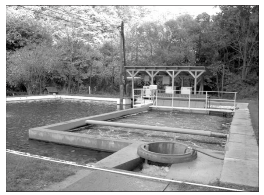
Figure 4. The view of the biological filter at the "Hoitsy and Rieger" intensive trout farm

through perforated pipes placed in the bottom of the filter tank. The air also provide oxygen to the nitrifying bacteria and helps the removal of harmful gases first of all CO<sub>2</sub>.