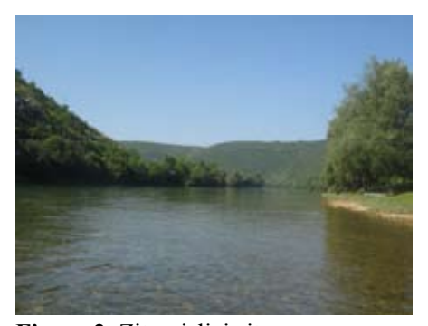
Figure 2. Zitomislici site