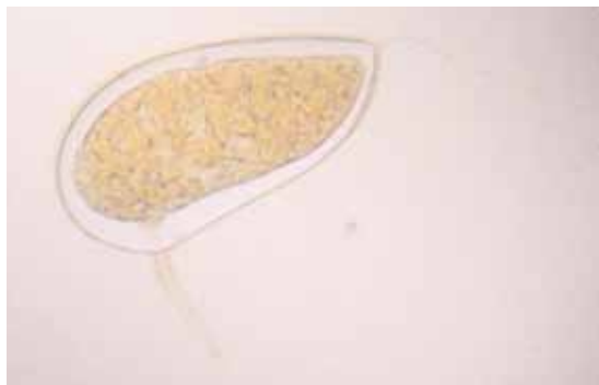
Figure 5. Egg of Homotoma ficus L. (original)

Fifth instar larva measurements (in mm). Body length (BL): 2.48-2.51; body width (BW): 2.28-2.44; antenna length (AL): 0.69-0.70; fore wing pad length (FL): 1.22-1.96; metatibiotarsus length: 0.57-0.58; caudal plate length (CL): 0.69-0.78; caudal plate width (CW): 1.09-1.22; circumanal ring width (RW): 0.32-0.35.