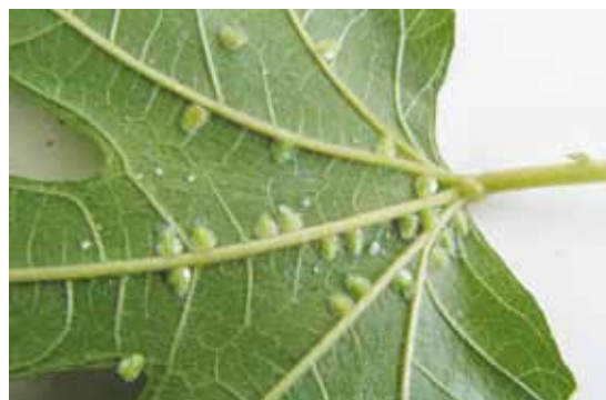
Figure 7. Larvae of Homotoma ficus on lower side of leaf Ficus carica (original)

(May 31, 2007 (L 5 )), Zeleni venac (DQ5724562323, 120) (August 15, 2007 (1♀, 1♂)), Zemun – Faculty of Agriculture (DQ5344865302, 75) (September 17, 2007 (2♀, 1♂, eggs), June 26, 2008 (L 5 ), September 1, 2008 (eggs, 3♀), May 6, 2009 (L 3 )), Zvezdara (DQ6130760301, 214 m) (April 13, 2008 (L 1 , L 2 )) and Banjica (DQ5749657607, 190) (September 10, 2008 (15♀, 12♂, eggs), September 23, 2008 (10♀, 8♂, eggs), April 8, 2009 (eggs, L 1 ), May 21, 2009 (L 4 , L 5 )).