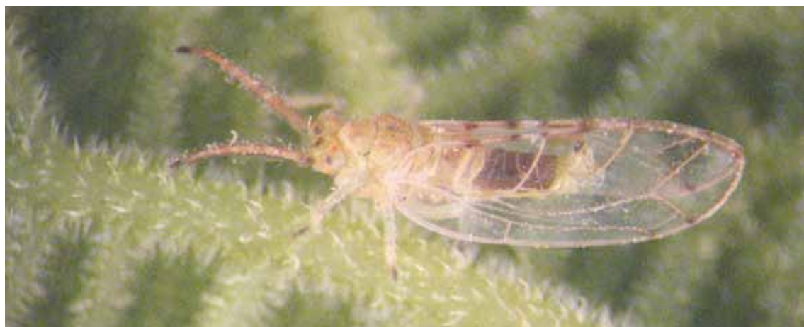
Figure 3. Adult male of Homotoma ficus L. (original)

Adult measurements (in mm). Male: body length (BL): 3.25 to 3.55; head width (HW): 0.73-0.75; antenna (AL): 1.62-1.67; fore wing length (WL): 3.86-3.90; fore wing width (WW): 1.38-1.42; metatibia length (TL): 0.82-0.81; male proctiger length: 0.40-0.41; paramere length (PL): 0.29-0.37; distal segment of aedeagus length (DL): 0.32-0.39. Female (BL): 3.50-3.80; HW: 0.77-0.82; AL: 1.55-1.60; WL: 3.52-3.76; WW: