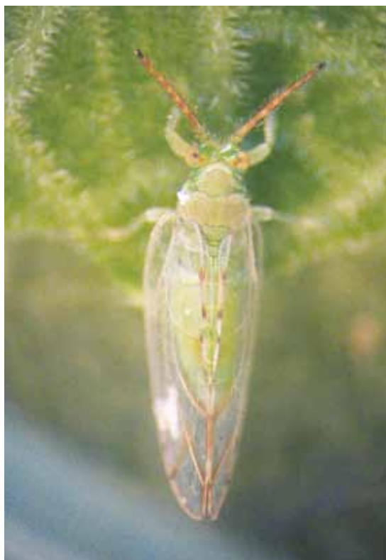
Figure 2. Adult female of Homotoma ficus L. (original)

Adult. Body light green in freshly moulted specimens, later becoming darker, light green-brown (Figure 2) to yellow-brown with dark brown abdominal tergites (Figure 3). Antennae densely covered with long setae, light brown, segments 9-10 dark brown (Figure 4b). Forewing apically angular; membrane transparent; veins bearing numerous conspicuous setae, light brown with dark brown spots on apices of veins M_{1+2} , M_{3+4} , Cu_{1a} and Cu_{1b} , and two spots on anal vein. Male terminalia with proctiger bipartite and paramere relatively narrow and parallel-sided, apically slightly turned posteriad (Figure 4d). Female terminalia relatively long, proctiger and subgenital plate apically subacute (Figure 4e).