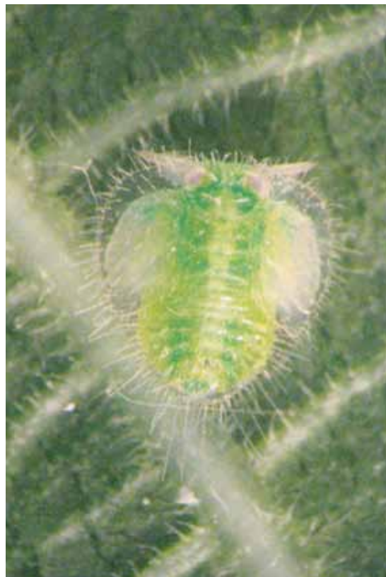
Figure 6. Fifth instar nymph of Homotoma ficus L. (original)

Localities. Dobanovci (DQ3789263688, 80 m) (May 11, 2008 (L 3 ), Novi Sad – Liman (DR1009911412, 80 m) (June 9, 2008 (L 5 , 4♀, 1♂), October 2, 2008, (eggs, 1♀), May 15, 2009 (L 3 )). Belgrade region: Voždovac (DQ5842859541, 85 m) (April 25, 2007 (L 3 ), May 3, 2007 (L 4 , L 5 ), May 26, 2007 (L 5 , 12♀, 9♂), February 27, 2008 (eggs), March 14, 2008 (eggs), October 21, 2008 (eggs, 5♀, 1♂)), Šumice (DQ5958159159, 85 m) (May 24, 2007 (L 3 )), Zemunski kej (DQ5437563864, 77 m) (May 10, 2007 (L 3 ), May 16, 2007 (L 4 , L 5 ), June 21, 2007 (L 5 ), July 18, 2007 (3♀, 3♂), September 20, 2007 (5♀, 3♂, eggs), October 8, 2007 (eggs), March 26, 2008 (eggs, L 1 ), April 7, 2008 (eggs, L 1 ), May 15, 2008 (L 3 ), May 30, 2008, October 19, 2008 (eggs, 3♀, 3♂), May 18, 2009 (L 3 , L 4 ), June 25, 2009 (L 5 , 4♀, 3♂)), Nova Galenika (DQ5021567776, 90 m) (May 9, 2007 (L 3 )), Lazareviceva street (DQ5779861931, 125 m) (May 25, 2007 (L 3 )), Studentski grad (DQ5245563671, 80 m)