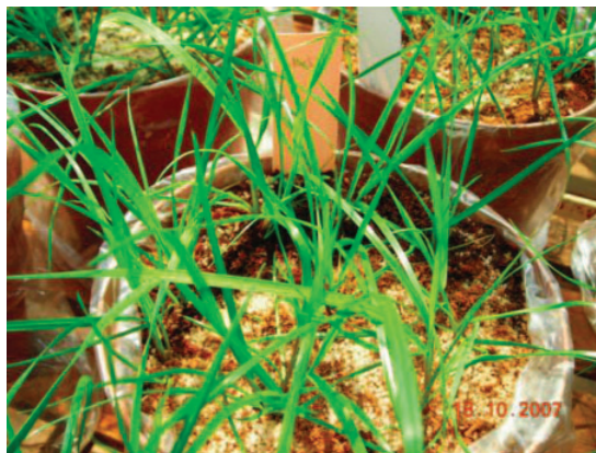
Figure 1. Lolium rigidum

Similar levels of differences in the amount of shikimic acid were observed. Every tested population contained higher amounts of shikimic acid compared to untreated control 2 DAA. At the following evaluation dates (4-6 DAA) the differences in the amount of shikimic acid between the populations were recorded. In LS and LPR populations there was a tendency of increase in the amount of shikimic acid, while in LR population after an increase in shikimic acid, 2, 4 and 6 DAA a lower amount of shikimic acid was recorded. The plants