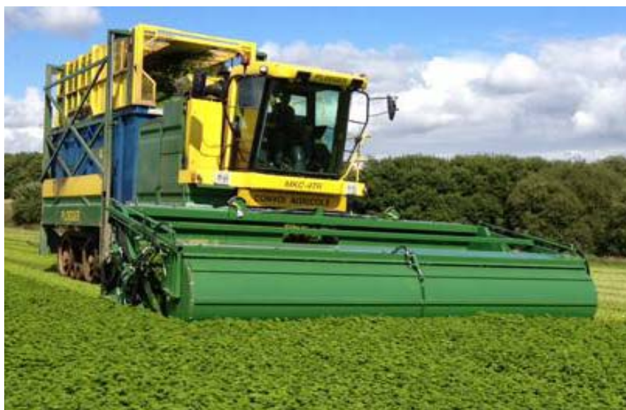
Figure 1. Ploeger - MKC 4TR parsley stripping unit

Cutting action is applied mainly to the leafy parsley, and any other green or similar plant parts. Each of these products needs multiple harvests for maximum yield specified to be sold at fresh market. In all cases, they have to be cleanly removed and handled softly for minimum leaf loss. Cutting is the most effective removal method, but it is also used in combination with other harvesting systems