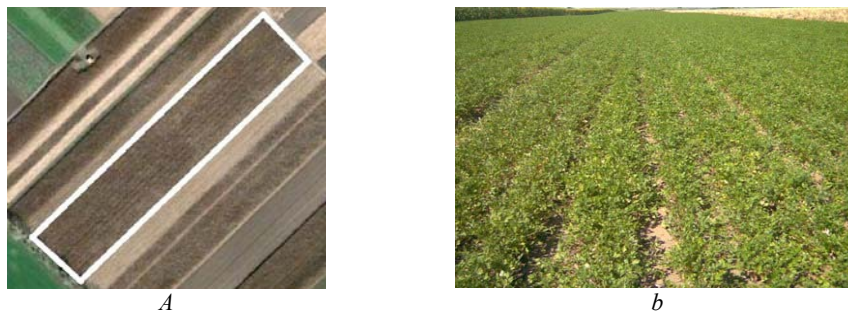
Figure 2. Experimental plot: a) plan view and b) crop

This paper presents results of testing three systems, commonly used in Serbia for mechanized harvesting of parsley leaves. The experiments were conducted during the second decade of the June 2012 in the region of the South Banat in north-east Serbia. Rectangular experimental plot is placed on flat terrain between the villages Kovin and Bavanište, at altitude 78 m. The position of experimental parcel, which photograph is given in Figure 2, is spatially defined by its GPS coordinates: 44°48' N and 20°53' E.