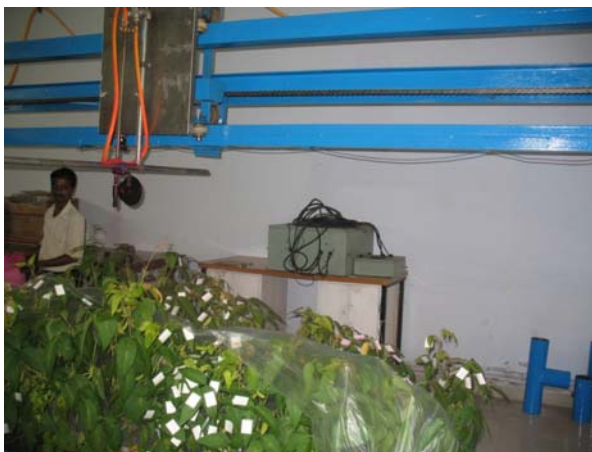
Figure 2. Spraying on one row of soybean plants keeping the other row covered.

An aqueous solution of a red colored dye was used for spraying and the samples of droplet images were collected. The impression of droplets was collected on white paper tags (40 mm x 30 mm) with known spread factor mounted on both the front side and back side of the leaves as well as on soil surface between the rows. During spraying of the dye on one row of soybean plants, the other row was kept covered with polythene sheet to avoid unwanted exposure to spray solution (Fig. 2).