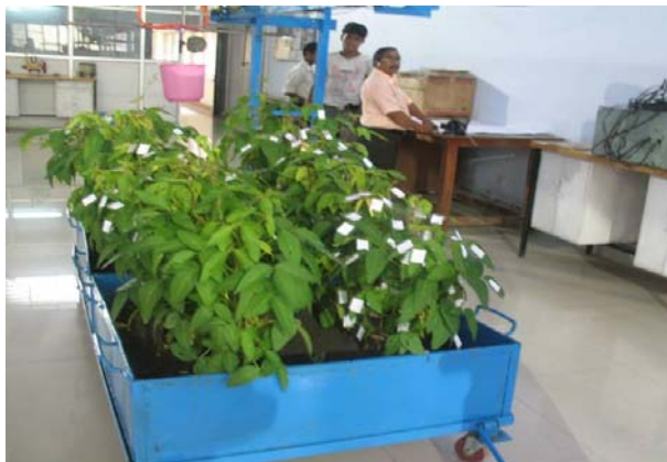
Figure 1. Soybean plants grown on portable trolley

The experiments were conducted using an over-head trolley set-up installed at plant protection laboratory of Central Institute of Agricultural Engineering, Bhopal in year 2012. Two hollow cone nozzles namely, HCN 80250 and HCN 80450 were selected for operating at recommended pressure of 3 \text{ kg} \cdot \text{cm}^{-2} . The overhead trolley was fitted with a removable air sleeve attached to a centrifugal blower of 1 \text{ m}^3 \cdot \text{s}^{-1} air discharge capacity to supply the air into sleeves to examine the effect of air assistance on spray. The controller for the movement was programmed to have three levels of travel speed ( 1.5, 2.5 and 3.5 \text{ km} \cdot \text{h}^{-1} ) of the trolley for estimating spray deposition efficiency on crop and soil. Two rows of soybean plants were grown in two boxes mounted on a movable trolley filled with soil up to depth of 30 cm for conducting experiment inside the laboratory (Fig. 1) at two different growth stages of the crop viz. 45 days and 80 days after sowing (DAS). The system was mounted on the overhead trolley test setup such that a distance of 45 cm between nozzle and plant canopy is maintained.