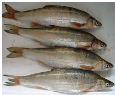
Figure 1. The chart of fishing locations at Buško Lake (prepared by Drešković, N.)

underneath the dorsal fin which were then cleaned with 10% KOH. This was followed by counting the sclerite rings (annuli) using the binocular microscope Binokulares LED Schulmikroskop BA 658 . Software programme SPSS for Windows 15.0 was used to perform the descriptive statistics in this paper.